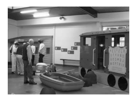
Launceston Club 239 members and guests toured the hospital children's ward to see their material donations in action.

Hours of work were invested in this project and it really enhances the room which has a model train and other railroad paraphernalia. The room provides a fun distraction for